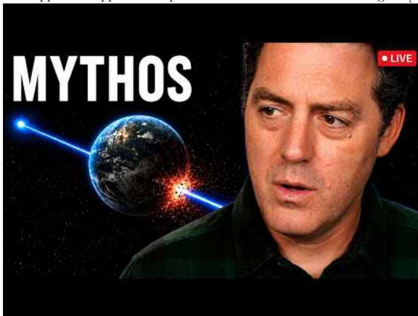
MYTHOS is LIVE!!!! (48:51)