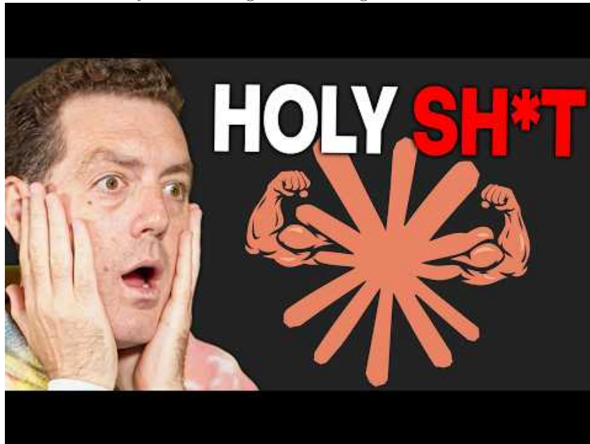
[6] MYTHOS MYTHOS MYTHOS (13:04)