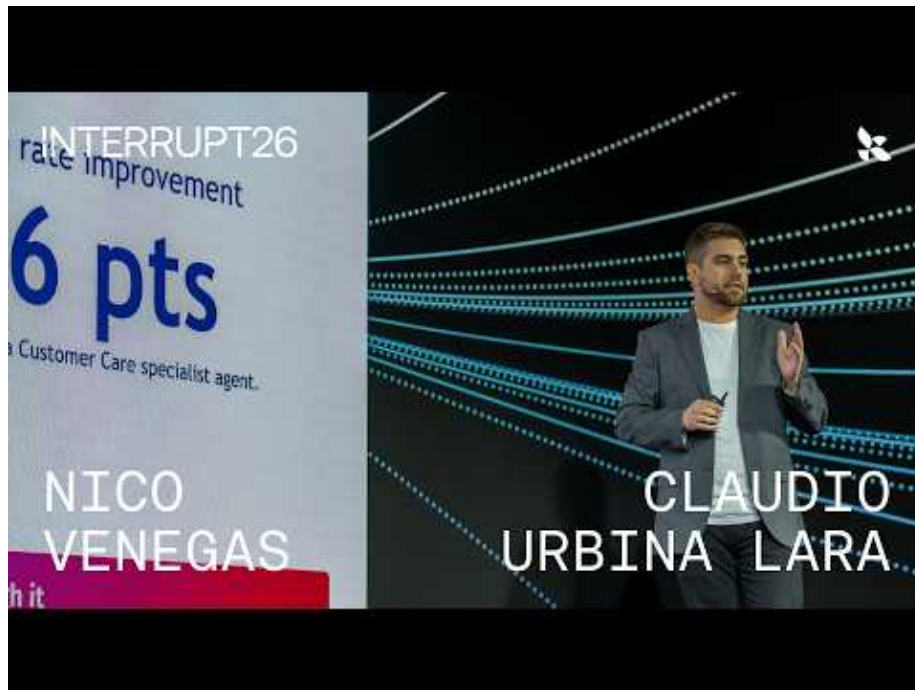
How LATAM Airlines Built Intelligent Agents in Aviation | Interrupt 2026 (6:21)